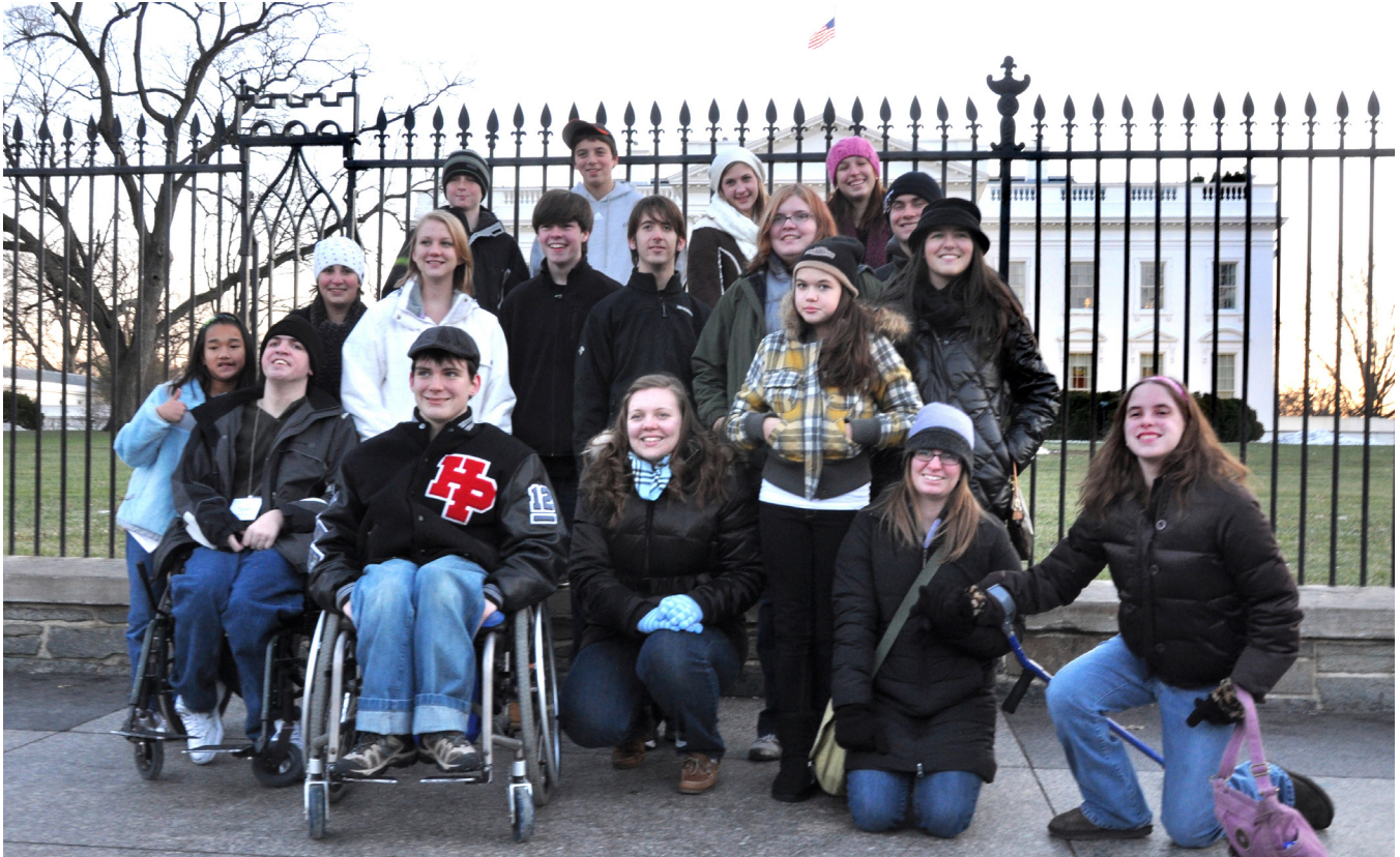
Youth leaders with and without disabilities from around the U.S. (posing in front of the White House) gathered in Washington, D.C., in January 2010 for the first National Youth Inclusion Summit, inspired by the film Including Samuel . These youth leaders created the “I am Norm” campaign during the weekend they spent together.

Youth empowerment or youth-guided organizations promote youth leadership and self-advocacy skills and opportunities to create positive change.