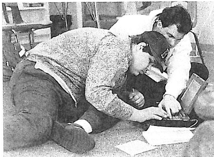
What could be more "functional" than learning how to use technology, working with others to solve problems, and getting your assignments in on time?

This essay is not an attempt to dismiss the value of instruction and experiences in a student's local community nor the opportunity to gain job experience. Instead it hopes to raise the question of the appropriateness of this occurring for students with disabilities when all other