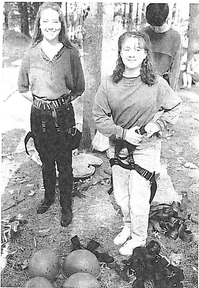
All students at Souhegan—not just those with disabilities—get experience meeting personal challenges on the ropes course.